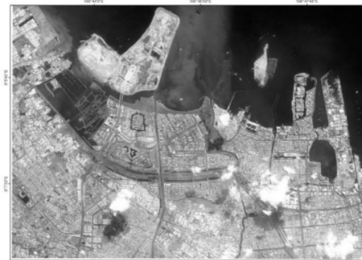
Figure 1. Study sites (Citra SPOT 6)

The study was conducted in the MAK ecosystem area at Penjaringan District, Jakarta Bay, DKI Jakarta Province with a coordinate of 6°05'20"-6°07'40" LS and 106°43'00"-106°48'00" East BT as shown in Figure 1.